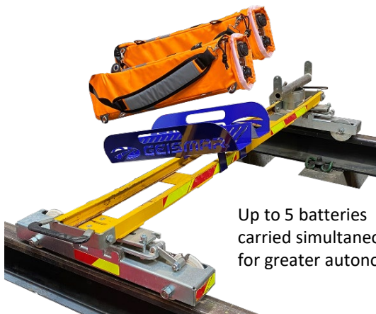
Up to 5 batteries carried simultaneously for greater autonomy