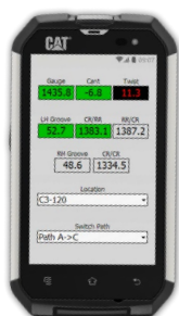
Robust PDA IP68 protection class