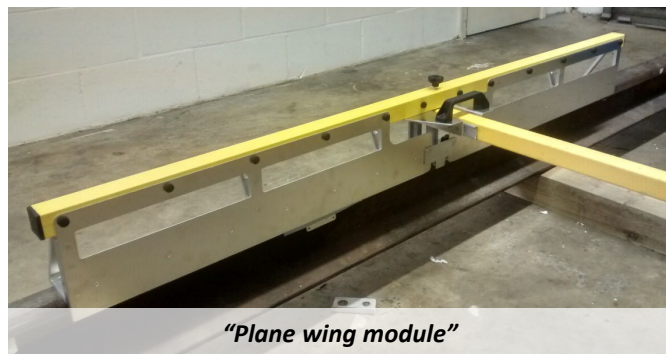
"Plane wing module"